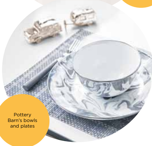
Pottery Barn’s bowls and plates