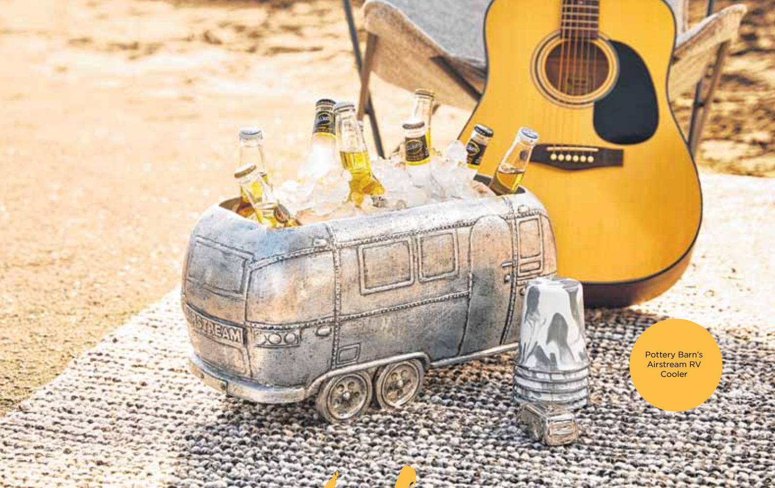
Pottery Barn's Airstream RV Cooler