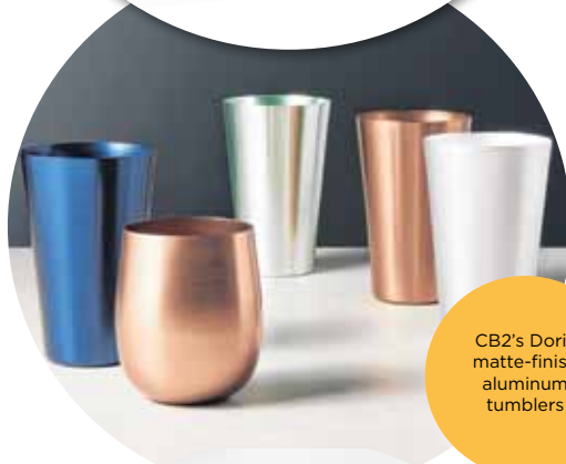
CB2’s Doris matte-finish aluminum tumblers