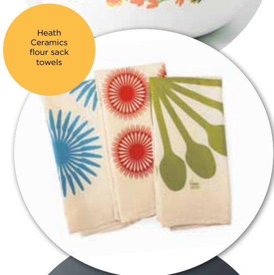
Heath Ceramics flour sack towels