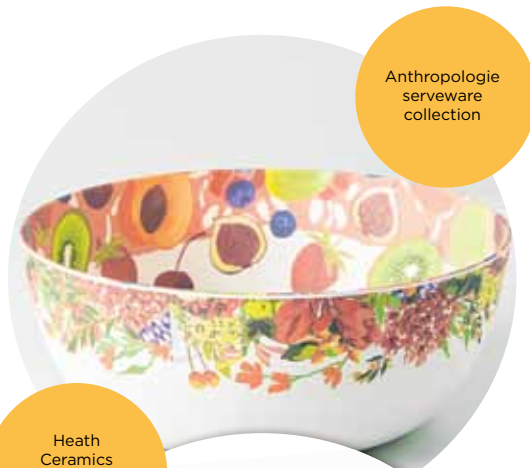
Anthropologie serveware collection

In a new collaboration with the RV company Airstream, Pottery Barn has a collection that includes a drinks cooler shaped like the iconic trailer; logo-embroidered napkins and tumblers; and bowls and plates in a gray-and-white enamelware swirl pattern.